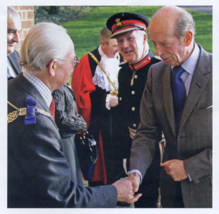
The Provincial Grand Master welcomes HRH the Duke of Kent and the Lord Lieutenant of Worcestershire to Rainbow Hill, Worcester